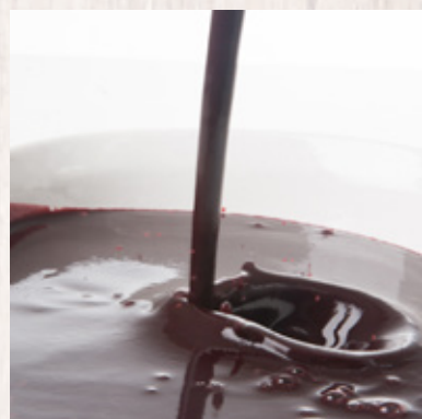
BLUE BERRY ♦♦♦♦♦♦♦♦♦♦♦♦♦♦♦♦