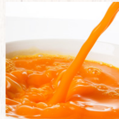
PASSION FRUIT ♦♦♦♦♦♦♦♦♦♦♦♦♦♦♦♦